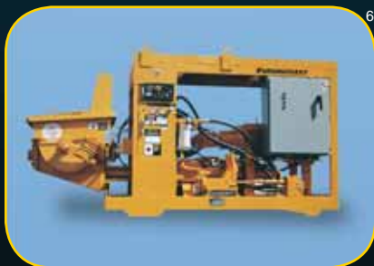
TKS Series • Skid-Mounted Available in diesel or electric skid-mounted versions. Contact factory.