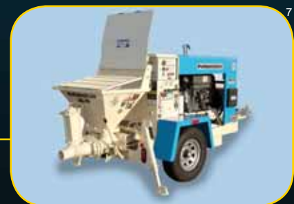
TKB Series Hydraulic Ball Valve Pumps Refer to separate specification sheet.