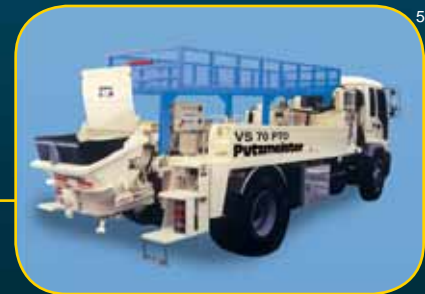
VS Series • Vehicle Mounted Refer to separate specification sheet.