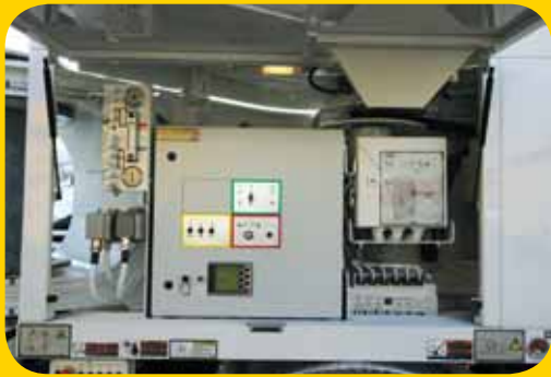
Modular Control Box