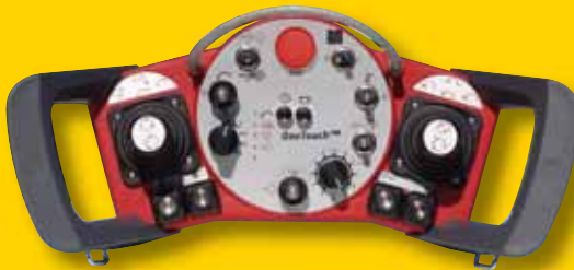
OneTouch ™ Radio Remote