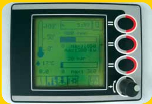
Ergonic ® Graphic Display